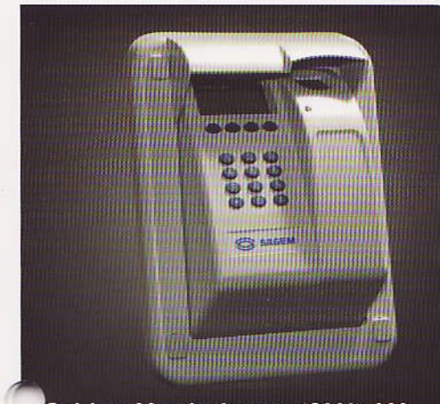
Outdoor MorphoAccess (OMA) 300 P P IP65 rated Access Control and T&A solution P P 48 000 user capacity P P Identification in 2 seconds or less P