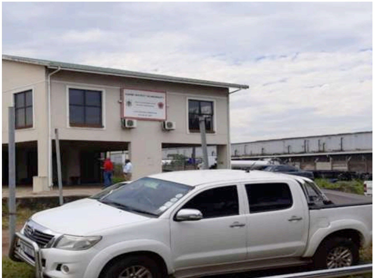
External view of the DMC from the carpark and the unused open ground floor space which lends itself to extended office space