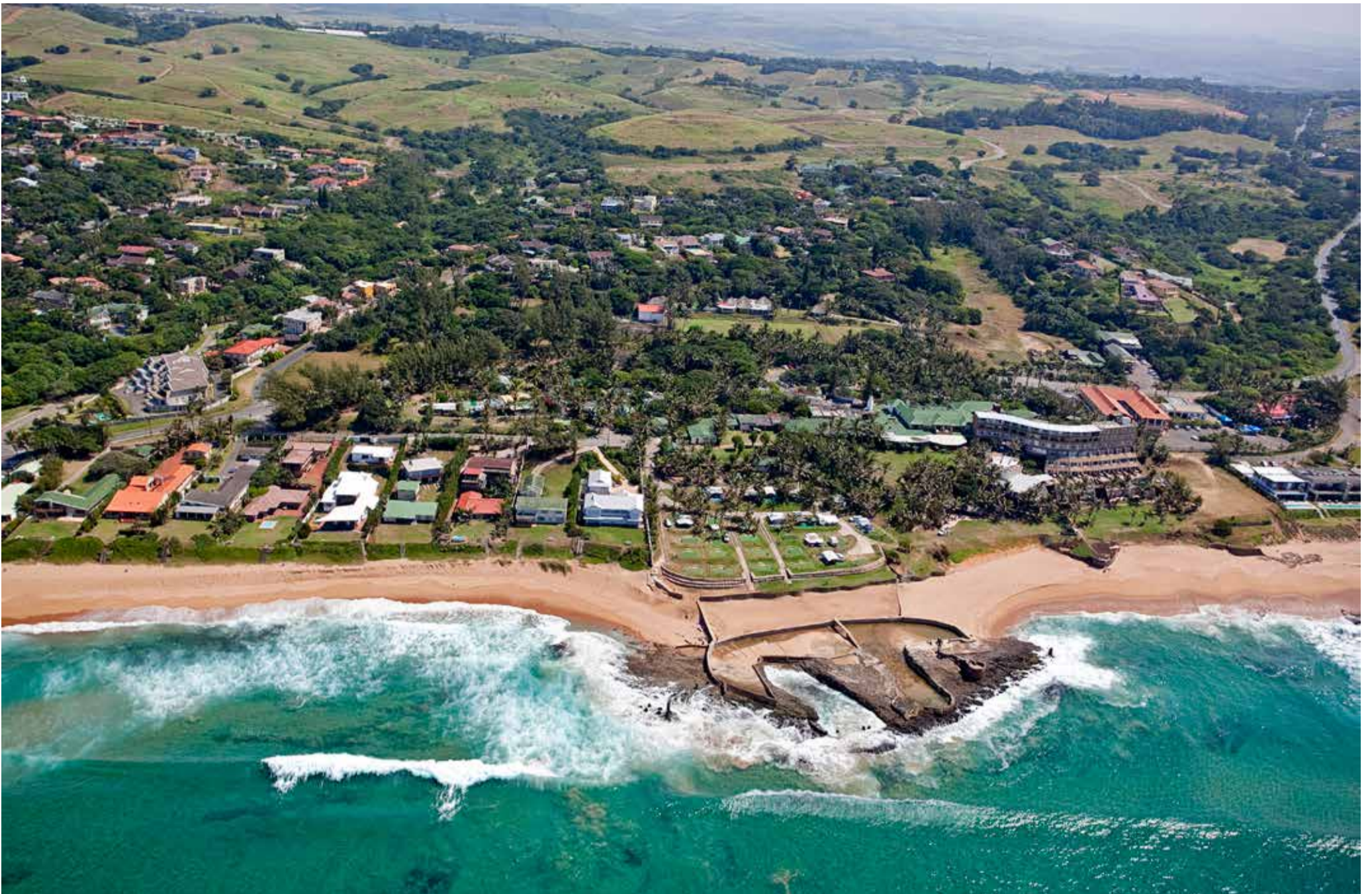
Rapid increases in property values have led to an increase in rates at Ballito, sparking calls to manage the rates more effectively