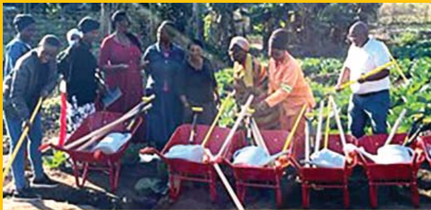
WOMEN'S MONTH OUTREACH PROGRAM

As part of the Women's month programme Enterprise iLembe and Dube Trade Port identified five female owned cooperatives in KwaDukuza and Ndwedwe to benefit from agricultural equipment supply. The cooperatives are Ayabongelwa, Intobeko Yomndeni from KwaDukuza and Sqondephambili, Emkhambeni and Mhlaziya Marry Grey from Ndwedwe Municipality.